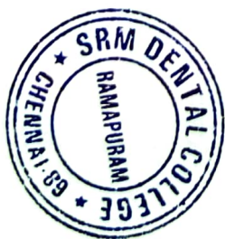
DEAN SRM DENTAL COLLEGE Bharathi Salai, Ramapuram, Chennai - 600 089.